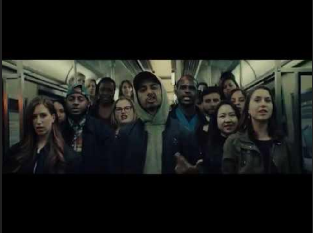
The Hamilton Mixtape: "Immigrants (We Get the Job Done)"

Why is this important? What is at stake if they do not succeed?