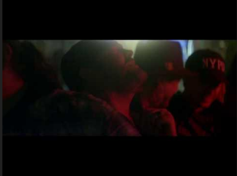
Lee Brice, "Drinking Class"

Why is this important? What is at stake if they do not succeed?