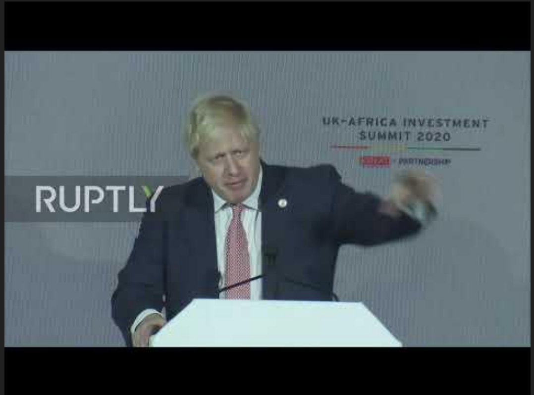
Boris Johnson Speech to the UK-Africa Investment Summit

Why is this important? What is at stake if they do not succeed?